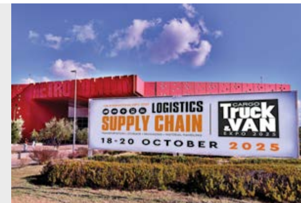
EXHIBIT CATEGORIES (HALL 3 & 4)

The trade show will take place at the state-of-the-art Metropolitan Expo exhibition centre at the "El. Venizelos" airport in Spata, Attica (end of Attiki Odos). Today, the Metropolitan Expo is the most contemporary and modern facility in Greece, combining a multitude of advantages such as: • State-of-the-art facilities and high quality services for exhibitors and visitors • Easy access by car and public transport • Next to the International Airport "El. Venizelos" • Spacious free parking • Restaurant, Cafe and Shopping in the airport's shopping park.